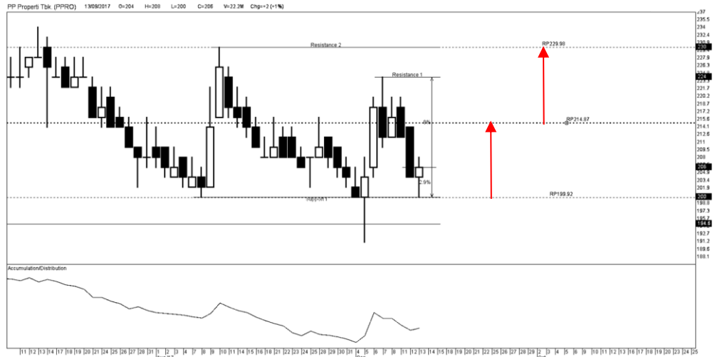
Kinerja harian saham PPRO

Danareksa research report are also available at Reuters Multex and First Call Direct and Bloomberg